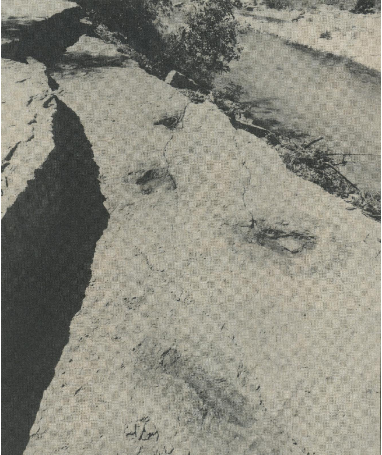
The alleged human footprints (foreground) and dinosaur tracks

were put on earth on the fifth day (“So God created the great sea monsters”) and man on the sixth day.