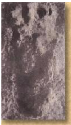
Track shown at Jeff Brenner's website. Presumable from the Turkmenistan site.

If the human track supporters believe that the American scientists, travel companies, and numerous visitors overlooked or neglected real human tracks, or were engaged in some kind of conspiracy or cover-up, documenting the prints in question should not be difficult. Indeed, several travel agencies offer tour packages that include a visit to the site.