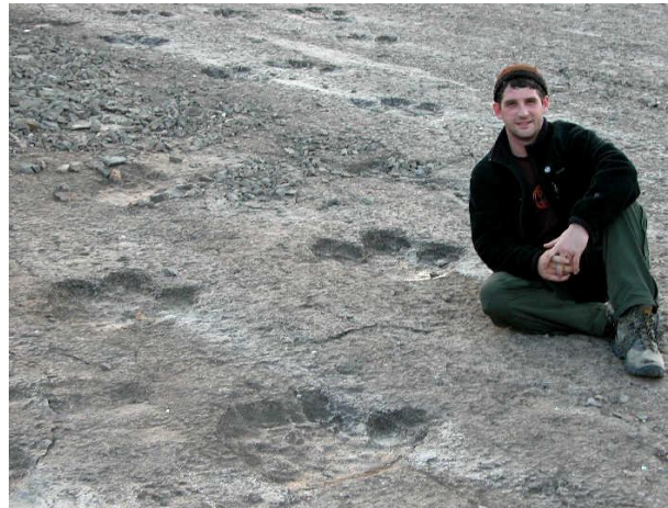
Turkmenistan dinosaur trails.

Despite these claims, Golovin's article did not include any photos or scientifically rigorous descriptions of the alleged human tracks, in terms of their specific size, clarity, shape and contour details, or stride patterns. Nor have any of the other creationist authors who repeat or encourage the human track claims.