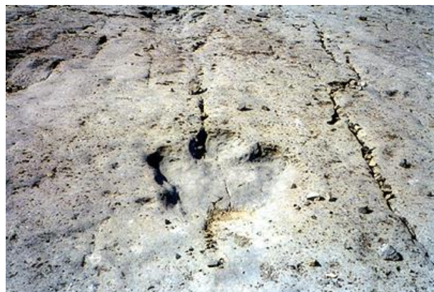
Turkmenistan dinosaur track shown at www.stantours.com website.