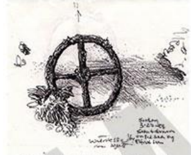
Eyewitness drawing of a 4-spoke chariot wheel seen in the Red Sea