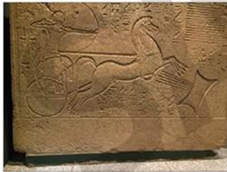
4-spoke chariot wheel