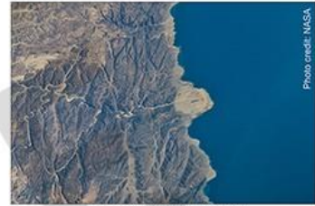
"Shut in" by the wilderness

And Moses said to the people, "Do not be afraid. Stand still, and see the salvation of the Lord... For the Egyptians whom you see today, you shall see again no more forever. Exodus 14:13