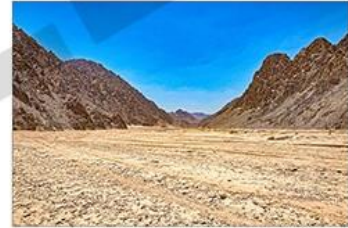
A dry river bed - only way into beach area