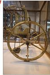
6-spoke chariot wheel