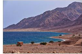
Mountains surround the beach area blocking any escape