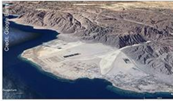
Large beach area on both sides of the Red Sea