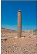
A lone pillar marking the spot?