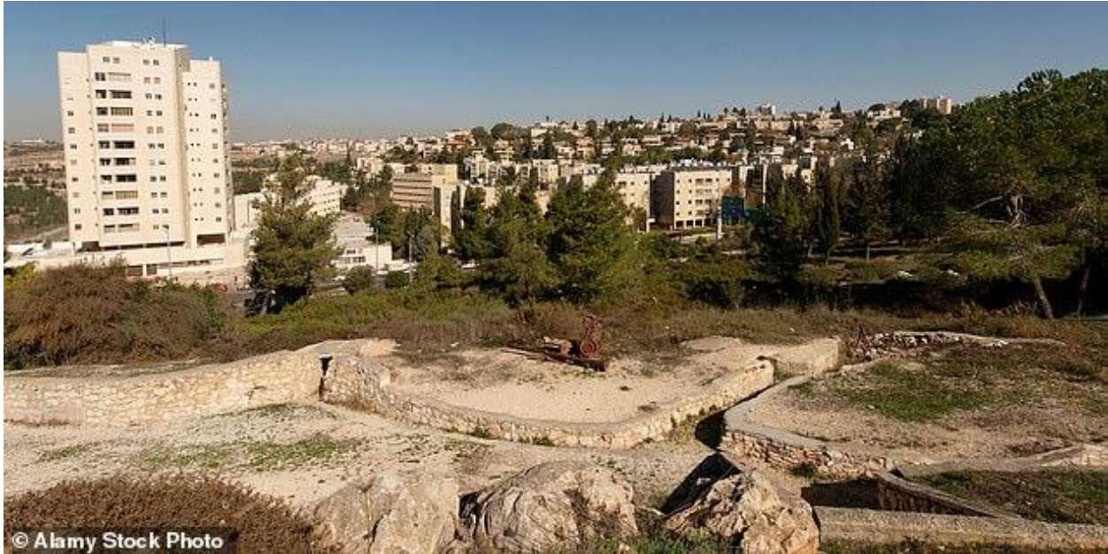
Three Bible stories in the book of 'Isaiah, 37:36-38' '2 Kings, 19:35' and '2 Chronicles, 32:21' detailed how the Assyrian soldiers were slain the night before they attacked Jerusalem. Pictured: The military site on Ammunition Hill