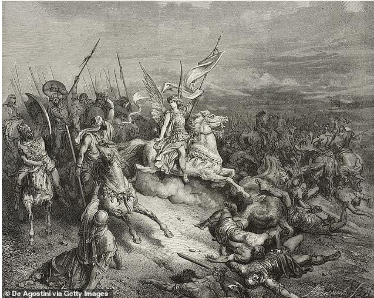
The angel of the Lord - written in Hebrew as malak Yahweh - translates to messenger of the Lord and was sent to protect Jerusalem after its ruler, Hezekiah, prayed to God for safety