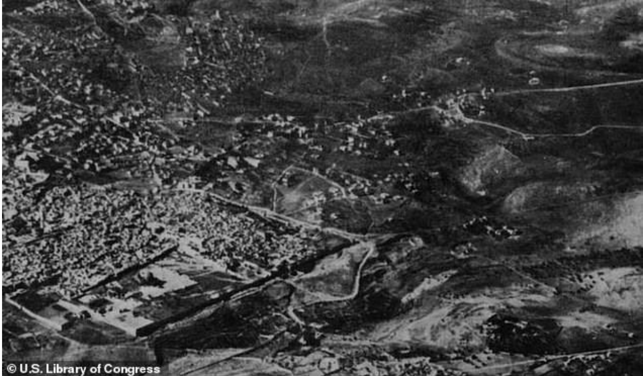
Compton reported that the methods used to find Sennacherib's camp site has led to the discovery of other Assyrian military camps. Pictured: 1930s aerial view of Jerusalem